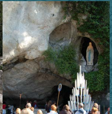
Grotto of Lourdes