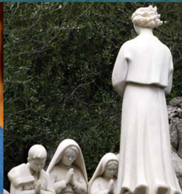
Shepherd Children Fatima