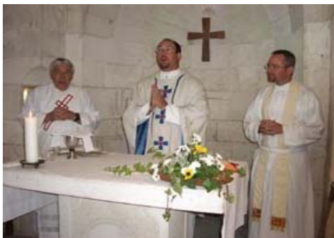
Private Daily Mass at the holiest sites in the world