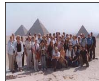
Pyramids of Egypt

Return home after a memorable trip to the Holy Land.